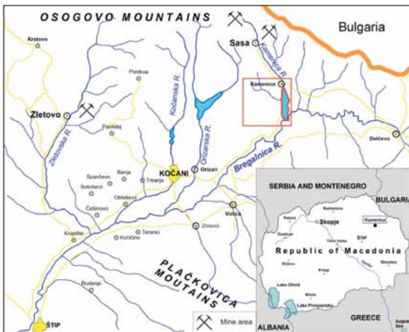
Figure 1. Geographical map of the investigated area (merilo 1 : 625 000)

Kalimanci artificial lake is located in eastern Macedonia, in the 2000 m high Osogovo Mountains, near the city Makedonska Kamenica and the Sasa mine (Figure 1). The surface of the lake is 42 km 2 , the maximum depth is 85 m and it encompasses around 120 \cdot 10^6 m 3 of water. It is supplied by two tributaries: the Bregalnica and the Kamenica River, which flows directly from the Sasa mine and drains a large amount of mining effluents and tailings material which have discharged into Lake Kalimanci.